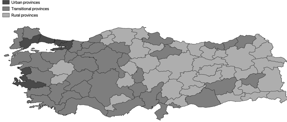
Figure 2: Classification of Turkish provinces

The resulting classification comprises 32 rural provinces, 34 transitional provinces, and 5 urban provinces, as illustrated in Figure 2. In the robustness checks section below, we discuss alternative approaches to distinguish between rural and urban provinces.